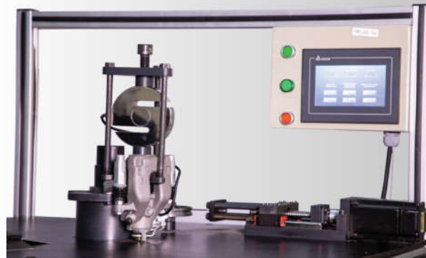
Brake Caliper Functional Tester