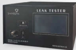
Leak Test Unit